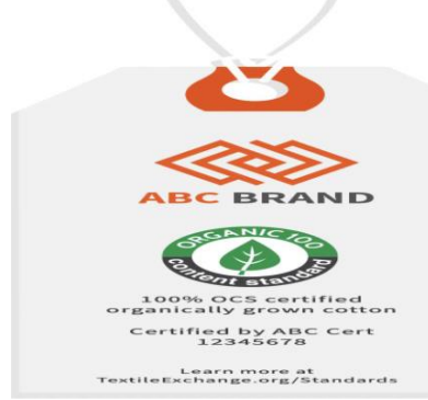
Product-related claim (on-product): OCS